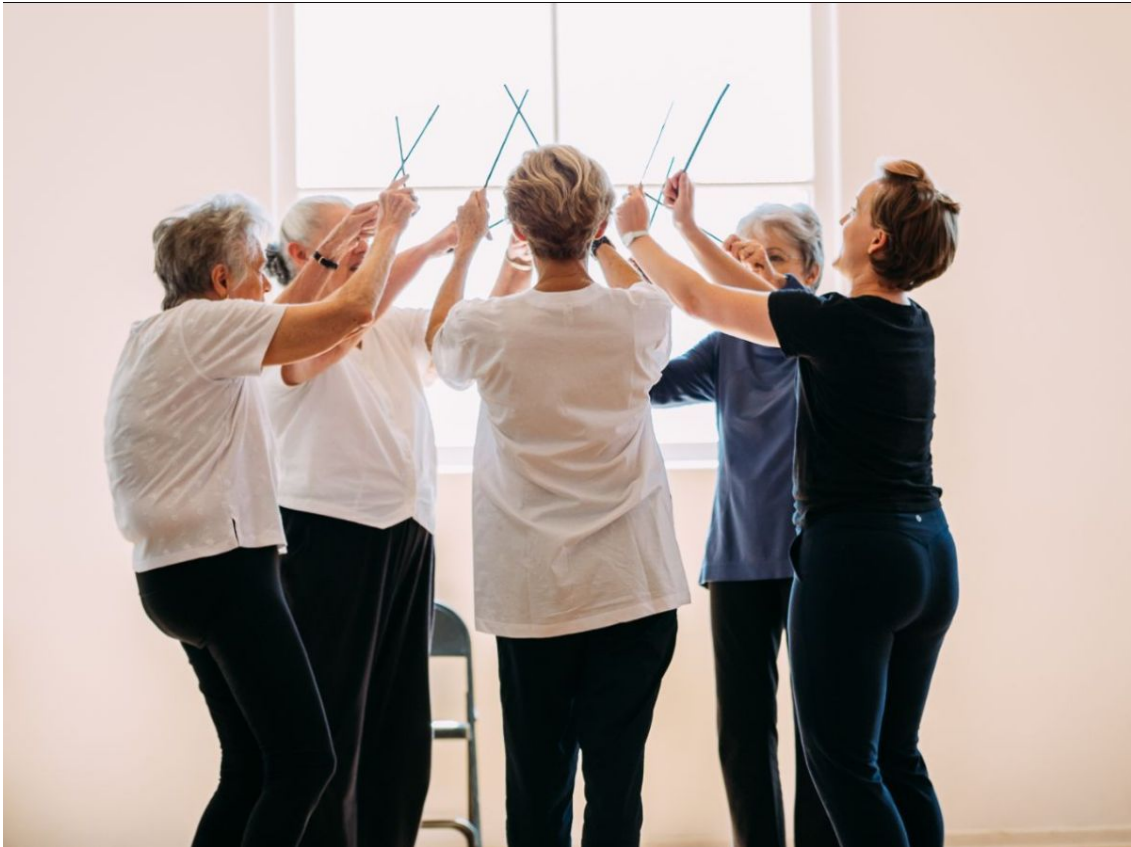
A Dancing Through Parkinson's Class